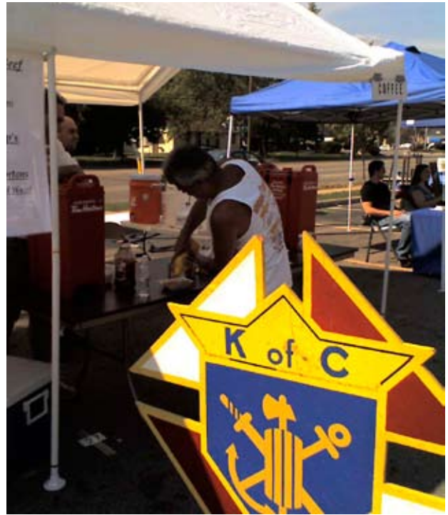
The view of our Food Booth